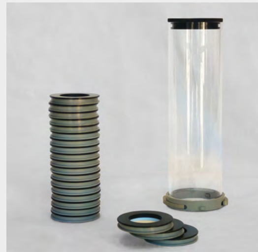
Filters and filter magazine